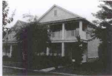
153 Fleets Island $229,900