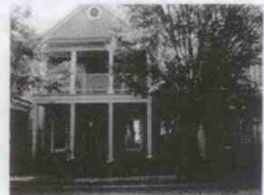
593 Montaigne $365,000