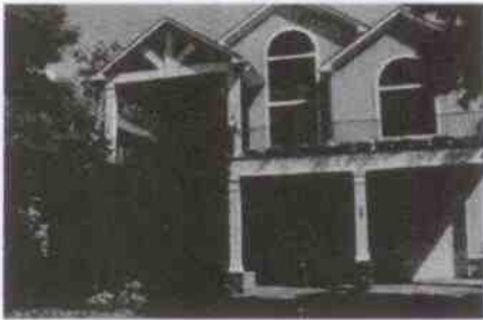
906 Harbor Bend $426,000