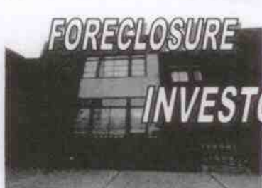
573 S. Front $253,500