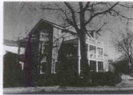
746 Island Dr. $590,000