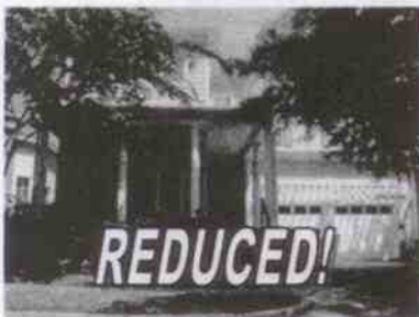
142 Harbor Isle Circle N $625,000