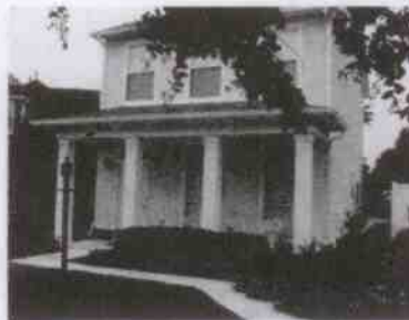
999 River Isle Cove $167,000