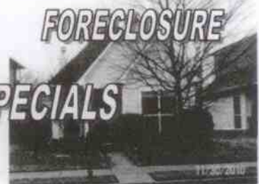
1053 E. Island Place $129,900

INVESTORS!—GET NOTIFIED WHEN A DOWNTOWN FORECLOSURE HITS THE MARKET!! CALL 901-338-4444