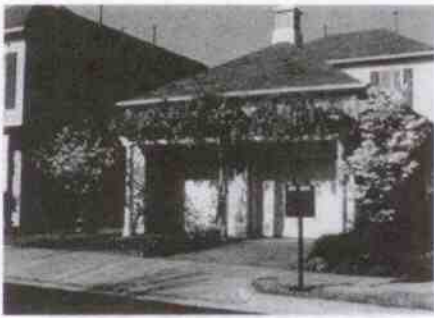
996 River Landing $349,900