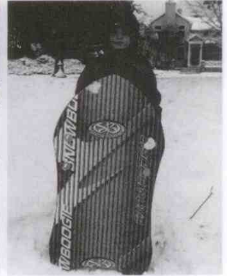
"Snowboards take over Harbor Town" (Ely Walker)