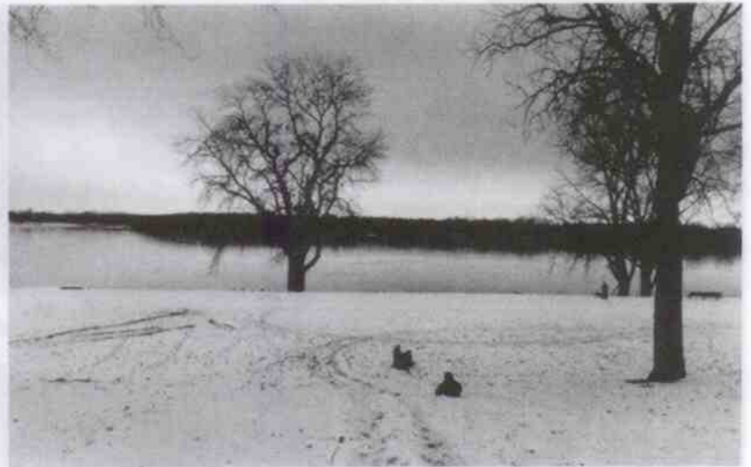
A snowy river day!