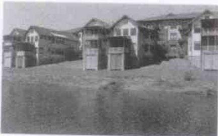
692 Marina Cottage.....$335,000