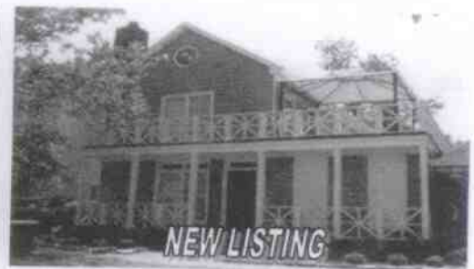
79 Harbor Village.....$269,900