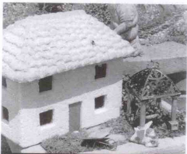
A fairy garden adds a magic touch to a yard.

All proceeds will go to beautify Harbor Town, so you will be helping the community as well. After the tour, enjoy a garden lunch special at Tug's or Paulette's in the River Inn.