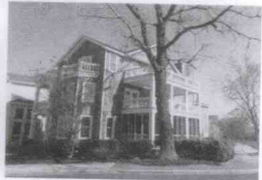
746 Island Drive.....$590,000