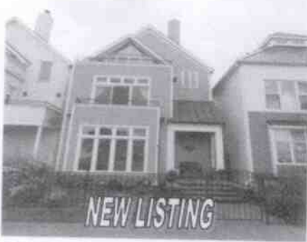
948 Island Dr.....$399,000