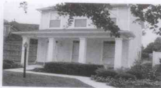
999 River Isle Cove..... $159,900