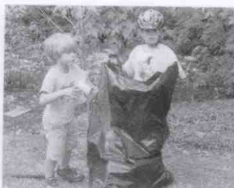
In addition to the fishing, some of our children took the time to collect trash that was once buried in the brush along the bank...THANKS KIDS!!!