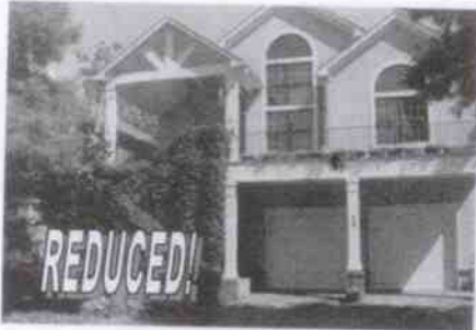
906 Harbor Bend..... $375,000