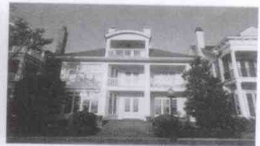
930 River Park ..... $829,000