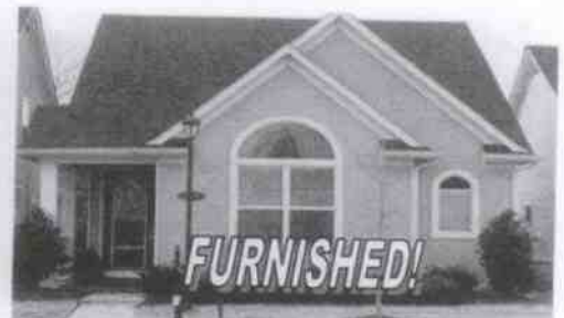
1369 Island Shore.....$199,900