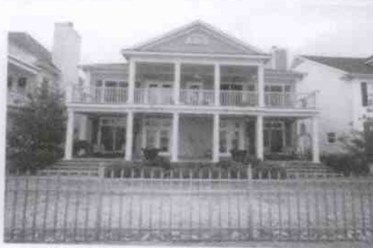
1005 Island Park.....$679,900