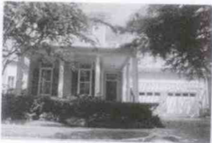
142 Harbor Isle Circle N $625,000