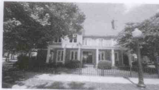
989 River Currents.....$495,000